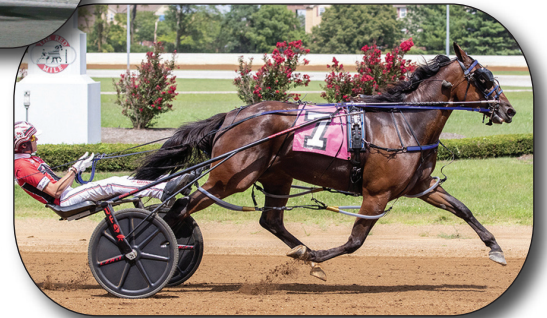
TWIN B JOE FRESH Older Mare Pacer