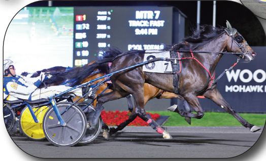
MONALISHI 2YO Filly Trotter