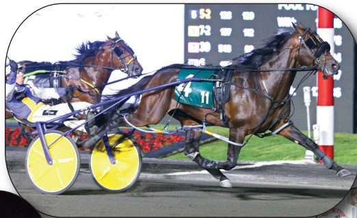
NIJINSKY 3YO Colt Pacer