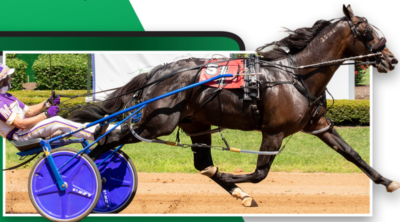
PERFECT STING Undeclared Breeders Crown Champion and 2020 Dan Patch Champion 1:49.2 $534,300