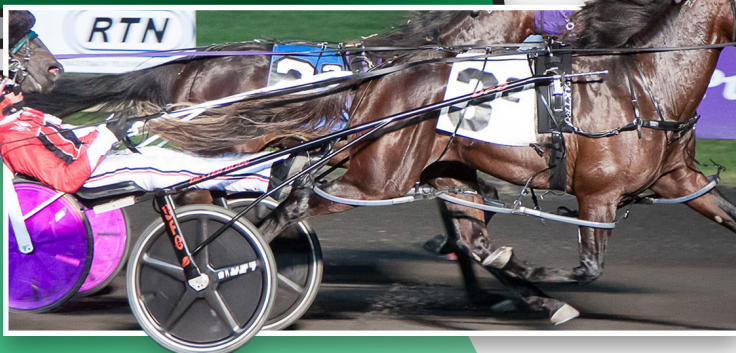
ALWAYS A MIKI Governors Cup Winner 1:50.2 $331,261