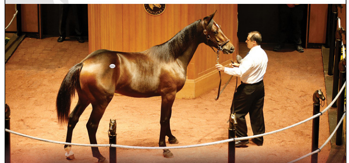
MUSCLE HILL-BEEHIVE C.—OUR LEXINGTON LEADER AT $450,000

Preferred's 2019 Lexington yearlings averaged $10,000 more than the record-breaking overall sale average. Now taking entries for the fall yearling sales.