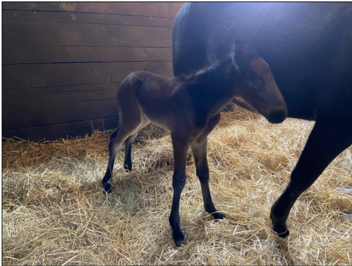
Hanover Shoe Farms