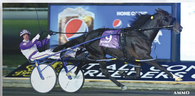
AMMO AND CONFEDERATE (WINNER OF THE $400,000 KENTUCKY CHAMPIONSHIP SERIES FINAL) WERE 1 ST AND 2 ND IN THE 2YO BREEDERS CROWN

HIS TOP-CLASS RACEHORSES CONTINUE TO BE STARS ON THE RACETRACK LED BY BREEDERS CROWN WINNER AMMO , CONFEDERATE , DANCIN LOU , FOUREVER BOY , LOU'S PEARLMAN , SPIRIT OF SAINT LOUIS (NZ) , AND WARRAWEE UBEAUT .