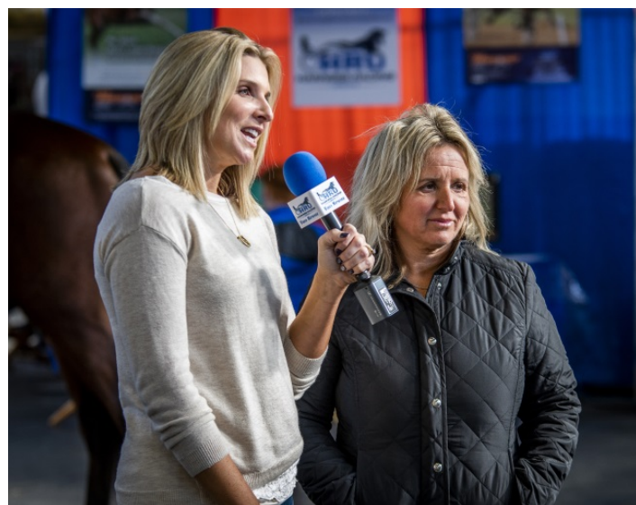
Triscari Video Web and Marketing