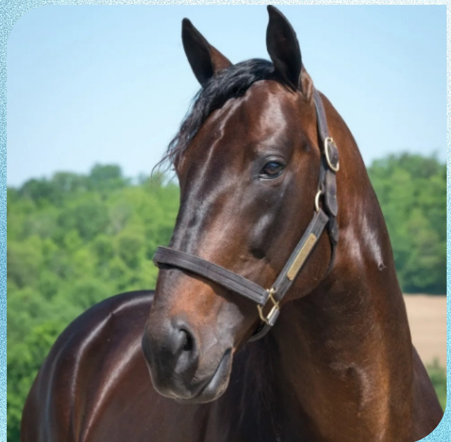
WINTERWOOD FARM OHIO