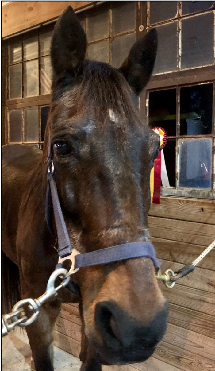
Cammies Lady turned 30 on Jan. 1.

Cammies Lady, an outstanding race mare during the 1990s, turned 30 on Wednesday (Jan. 1), the official birthday for all standardbreds.