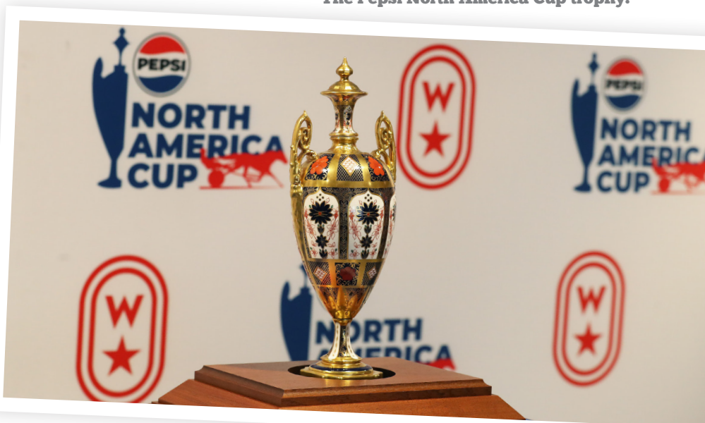
Claus Andersen The Pepsi North America Cup trophy.

a guide for any win bet, see the PLAY list after each race; it suggests win-pool overlays that may be available depending how the pari-mutuel pool is affected by the betting public. For the best wagering results do not accept less than the suggested payoffs.