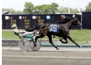
Check Me Out might go in the Hambo