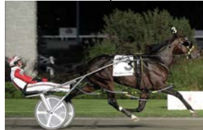
Sweet Lou is already hunkered down for the winter

The smashing winner of the 2-year-old Colt & Gelding Pace and the fastest 2-year-old ever has already shipped to South Carolina to unwind and gear up for next year.