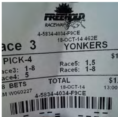
This ticket singling Nuncio in the Yonkers trot was a winner, but the player did not get paid

Total handle on all harness races is down nearly close to a double digit percentage this year when compared to just last year, and you don't have to look very far for reasons why. Those in the betting public have long had to consider nefarious factors when wagering such as questionable drives, suspect trainers, form reversals, short payoffs and now should question those entrusted to safeguard the integrity of the sport, appointed judges.