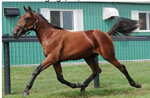
Machme To The Moon was the sale-topper at Forest City

LONDON, Ontario --The first session of the Forest City Yearling Sale, which took place in London, Ont., concluded with a decrease of 37.5 per cent compared to one year ago. A total of 119 yearlings were sold today, totaling $1,802,500, while averaging $15,147.