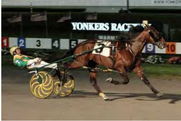
Heston Blue Chip

Three divisions--two off the card--went postward in a brisk wind.