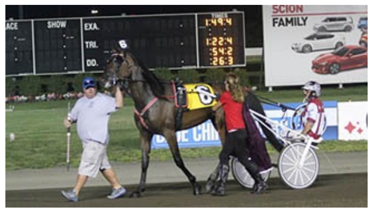
History was made last night at the Meadowlands as JL Cruze won the Graduate in a world-record time of 1:49.4

The same horse that was a non-entity last year at 3, won for the 15th time this year from 17 starts and did so in the fastest ever trotting mile in the storied history of the Meadowlands. Holding off a fierce late rally from the mare Shake It Cerry, JL Cruze won last night's $250,000 Graduate Final at the Meadowlands by a nose in 1:49.4. It was the fastest mile in history by a trotter on a one-mile track.