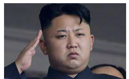
Is this man running harness racing?

This past weekend the U.S. Open golf tournament was