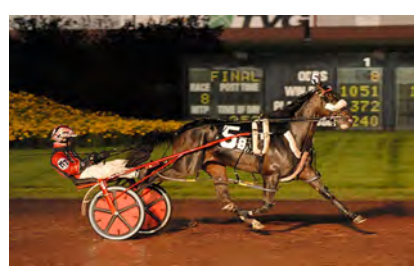
Wiggle It Jiggleit

While this was a far easier assignment than the one he faced in the North America Cup when second behind