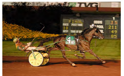
Wakizashi Hanover

Wakizashi Hanover is for real...but you already knew