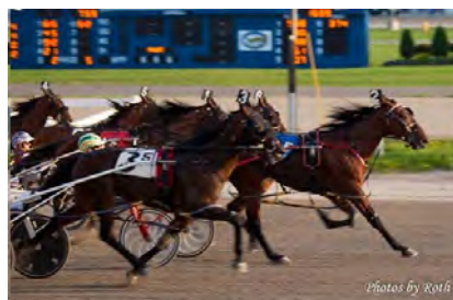
Murder He Wrote

HAMBURG, NY - Murder He Wrote registered a giant shocker at Buffalo Raceway Friday night as he rallied in deep stretch to pull off the $92.50 upset in the $60,200 first division of the New York Sire Stakes for 3-year-old pacing colts and geldings. Murder He