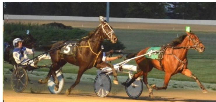
Bee A Magician holding off DW's NY Yankee

COLUMBUS, OH - The girl beat the boys and the invaders whipped the home team.