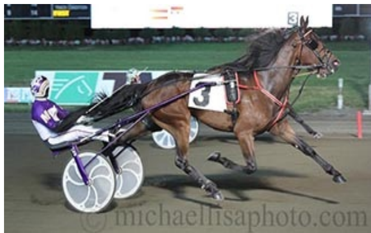
JL Cruze got the job done over Father Patrick last night at the Meadowlands

He looked like the biggest cinch since American Pharoah in the Belmont Stakes, but 1-9 shot Father Patrick came up short last night in the Graduate Series at the