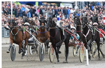
Bee A Magician beats the boys again, wins Charlie Hill

Magic Tonight, Elitlopp Winner, To Campaign Extensively in US