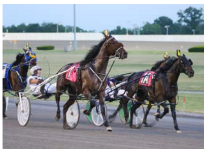
In The Arsenal had a hard time keeping a straight course in the Rooney