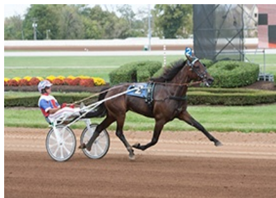
Takter on Shake It Cerry: "She's back!"

Jimmy Takter will look to sweep both divisions of the Graduate Series in the trotting ranks tonight at the