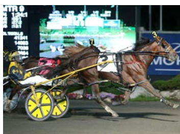
Traceur Hanover returns to action tonight at Mohawk

With the top three in the 3-year-old male pacing division—Artspeak, Wiggle It Jiggle It and In The Arsenal—sitting out tonight's Somebeachsomewhere at Mohawk, there'll plenty of opportunity for a lesser light to pick up a nice check.