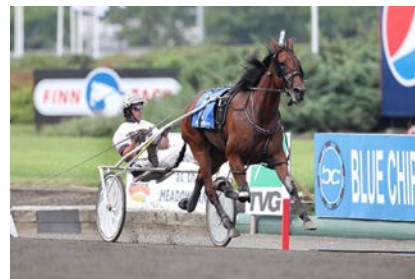
Bee A Magician

The $200,000 Charlie Hill at Scioto Downs doesn't figure to be that competitive of a race. The wonder mare Bee A Magician heads the field and looks to return to the winner's circle after finishing second behind Father Patrick in the Maxie Lee at Chester. There are no Father Patricks in here