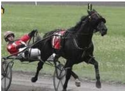
Roadside Delight is at the center of Tioga controversy

According to an incident report issued by the NYSRWB and obtained by Harness Racing Update, Roadside