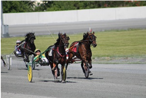
Market Share, on his way to victory in the Maxie Lee