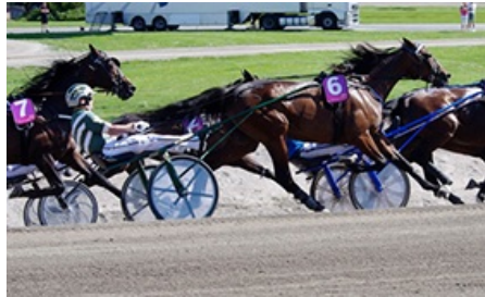
Maven in action at Solvalla

country. They believed in me and sent over this horse, and