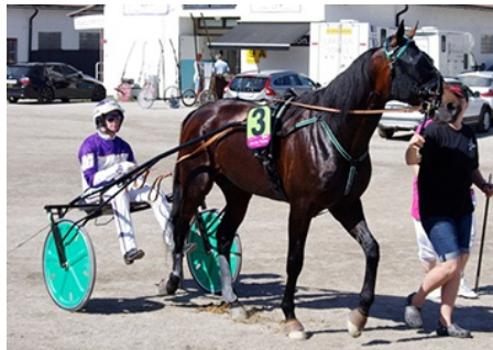
Uncle Peter heads to the track for the Elitlopp elims