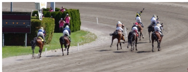
Trotters under saddle on an undercard race