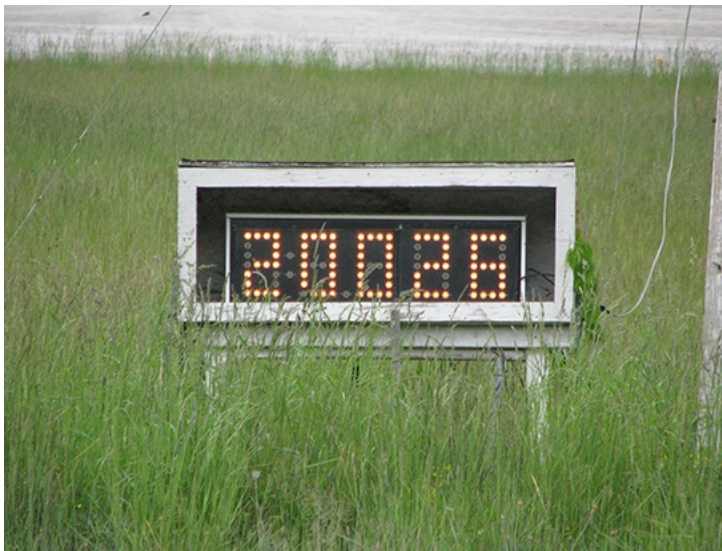
A teletimer pokes out from the weeds