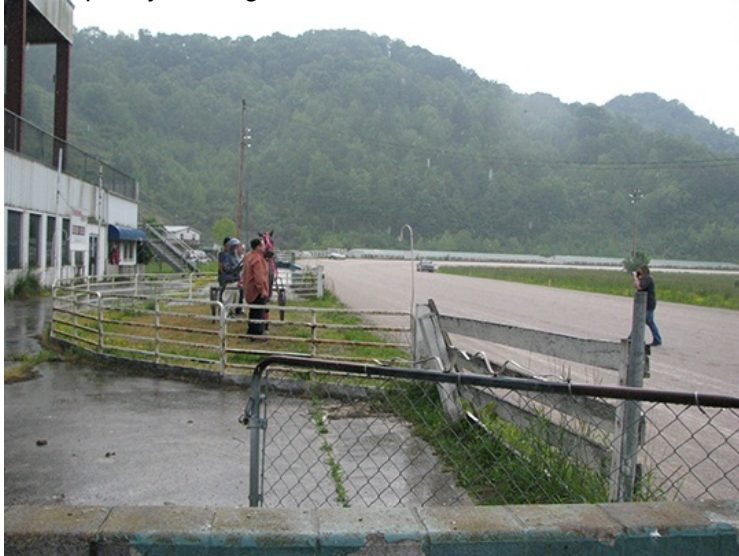
In the winner's circle at Thunder Ridge

That's why I drove 673 miles from my New Jersey home to Prestonburg, Kentucky the other day because I had to see firsthand the strangest racetrack there has ever been, to see if this place that was beyond belief was actually for real. And I was quickly running out of chances.