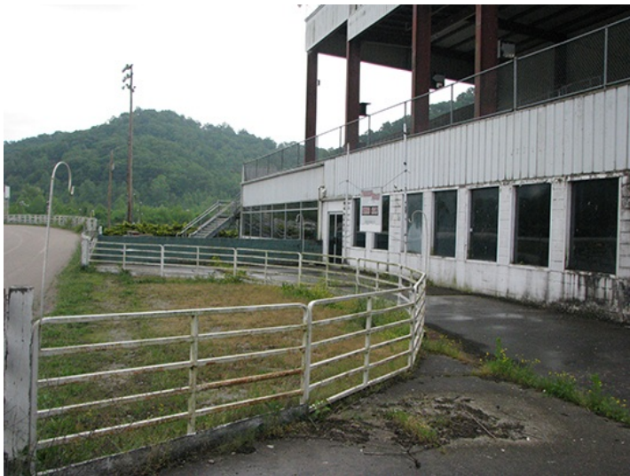
The grandstand has seen better days