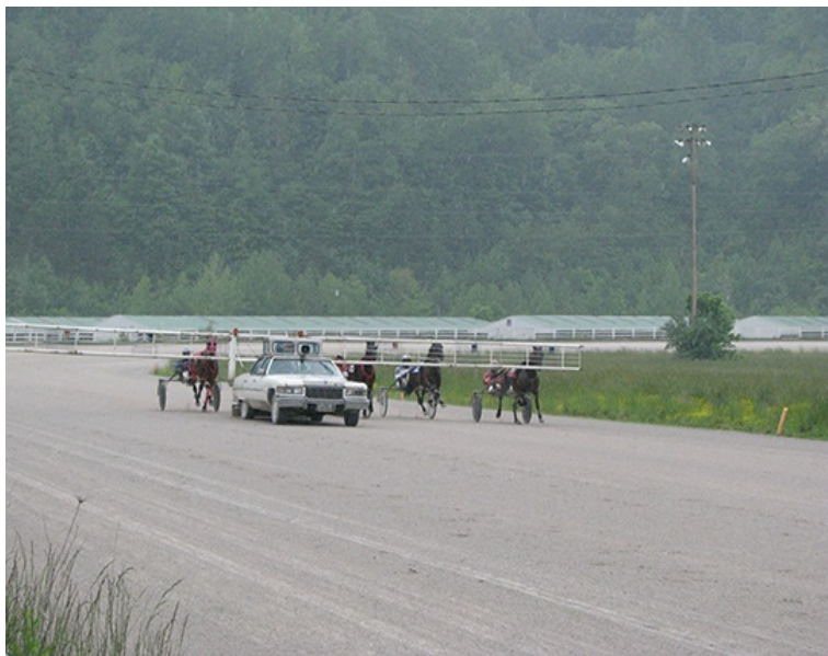
A verdant backdrop, but no attendees, at Thunder Ridge