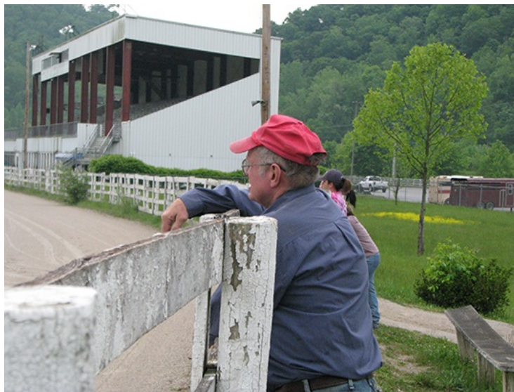
The 'crowd' at Thunder Ridge