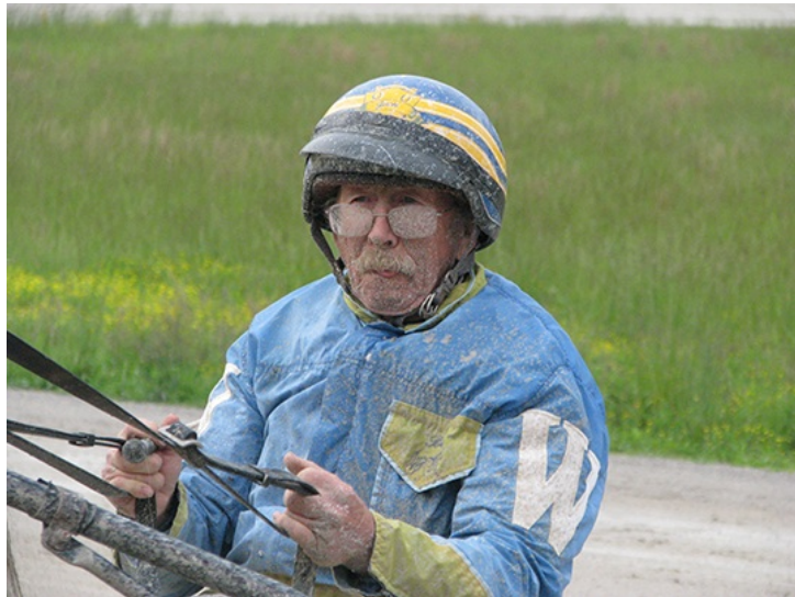
A member of the driving colony at Thunder Ridge