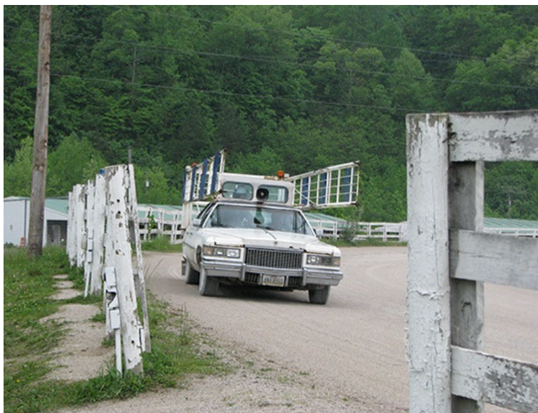
The starting gate shows signs of wear and tear