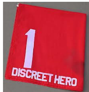
Shouldn't saddle cloth colors be the same in both breeds?