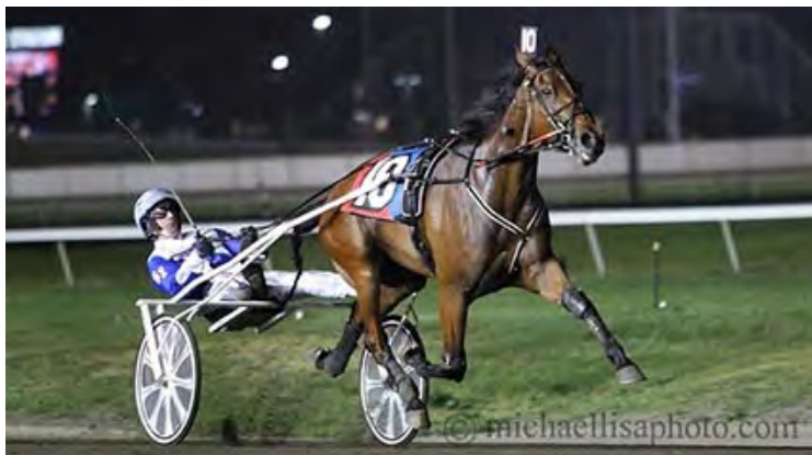
Bee A Magician looks like she's going to be a major player this year