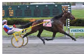
Sarcastic Man