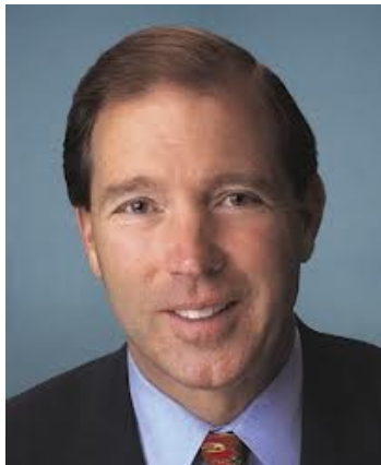
New Mexico Senator Tom Udall wants to clean up horse racing

Harness racing may soon lose the right to police itself. U.S. Sen. Tom Udall (D-N.M.) and U.S. Reps. Ed Whitfield (R-Ken.) and Joe Pitts (R-Penn.) have revealed draft legislation they intend to introduce which, according to a press release released by the trio, would "end doping in horseracing and kick cheaters out of the sport."