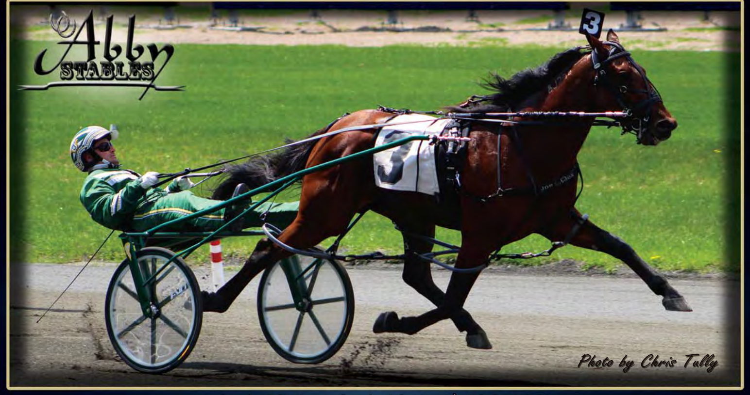
p,2, 1:49.4, p,3, 1:49.4 ($402,478) WESTERN IDEAL - MAJOR HARMONY - ART MAJOR

WESTERN VINTAGE blazes into Ohio for the 2015 breeding season being the only stallion standing in Ohio with a sub-1:50 mark as a 2-year-old at 1:49.4 taken when winning The Bluegrass Stakes in Lexington by four, pulling away from the field!