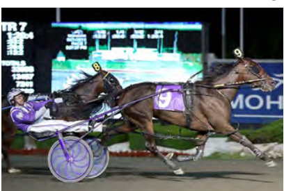
Rocklamation will race a full campaign this year

"Whatever issues she had last year have seemed to resolve themselves and as long as she stays sound we