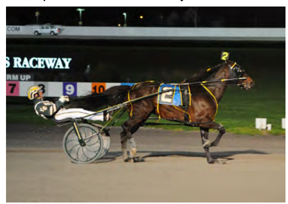
Foiled Again will be conspicuous by his absence in tomorrow's Levy at Yonkers