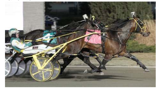
Hypnotic Blue Chip capturing the Spring Pacing Championship

Unleashing a breathtaking stretch surge, Hypnotic Blue Chip swept past the field for his first win in three starts this season. The 5-year-old found his best stride at an opportune time. The season got off to bumpy start at the Meadowlands. He suffered some cuts when a rival broke right in his face in his debut and then followed that a second place effort as the 1-2 favorite.