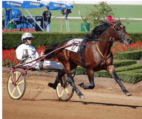
Muscle Hill, a "genetic freak"

and they took on a three-year-old Muscle Hill? We'll never know, thanks to a system that affords stars two seasons to strike it right on the track and then retire.