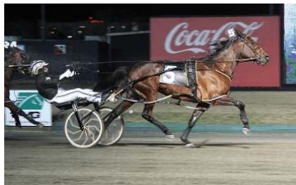
Higher And Higher

Finish Order: Rocklamation, Royal Cee Cee N, Rock N Soul, Anndrovette, Chancey Lady, Ginger And Fred To view replay click here