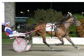
Intimidate is going to have a light campaign in 2013