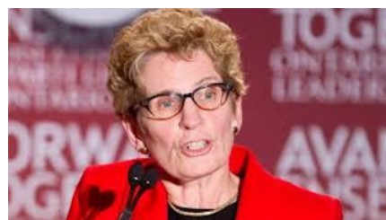
Kathleen Wynne: "blah, blah, blah, blah."

In fact, after hearing Kathleen Wynne offer a somewhat murky message at Grand River Raceway in front of the media, horse racing people and a member of an opposing provincial party, not everyone came away thinking it was a Wynne-win situation. If anything, Wynne only created more uncertainty by saying a lot but not revealing salient details to soothe the anxious industry.