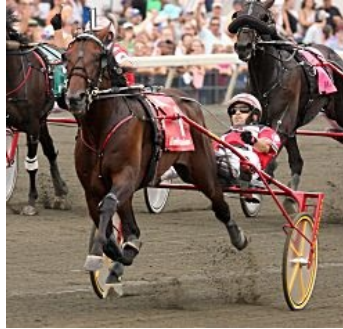
The return of Broad Bahn is not a reason to cheer