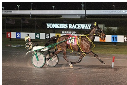
The remarkable Foiled Again

Making his first appearance on the racetrack this year, 11-year-old Foiled Again won a qualifier yesterday morning at the Meadowlands in 1:54.3. He is tuning up for his annual appearance in the Levy series at Yonkers. He won the qualifier by a neck over Aslan and regular pilot