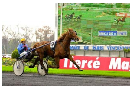
The great European stallion Love You

Love You might well be considered the most dominant stallion today in the world of trotting.