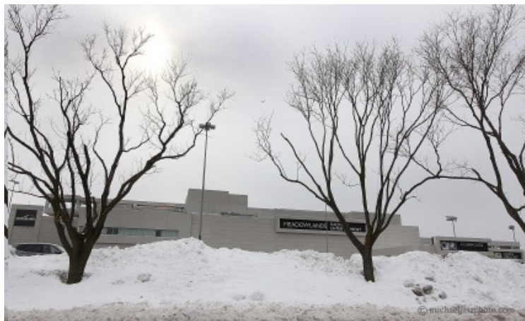
Spring Break can't come soon enough @ The Meadowlands

Both $.20 cent Jackpot Super Hi-5 wagers carried over, with the fifth race carryover reaching $47,522 and the last race carryover growing to $161,277.