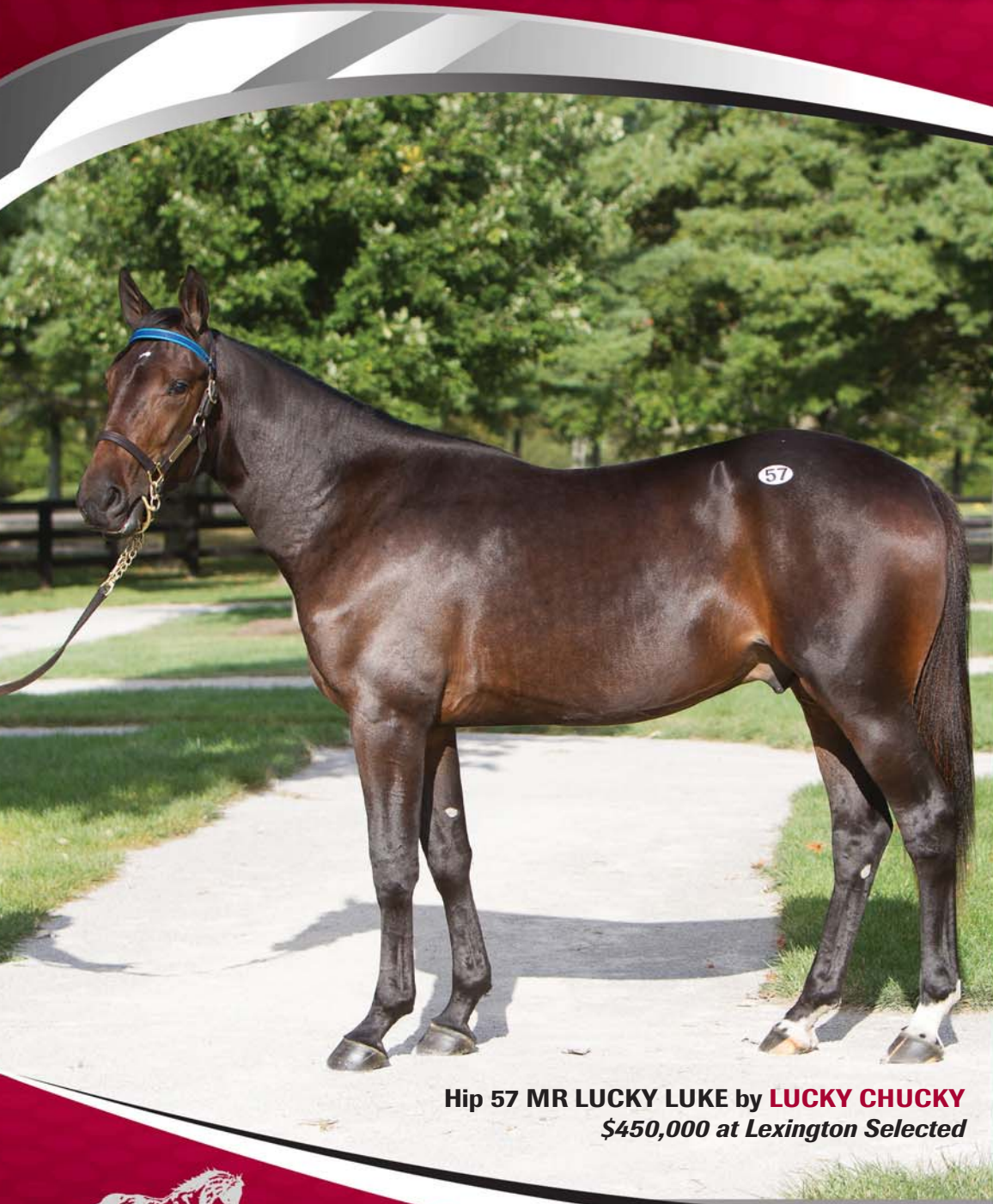
Hip 57 MR LUCKY LUKE by LUCKY CHUCKY $450,000 at Lexington Selected