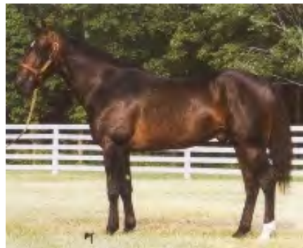
Cam's Card Shark