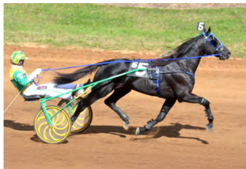
Archangel is back, and Burke has him

Unraced since the 2012 Breeders Crown eliminations, Archangel, now 5, is back in training and will resume his