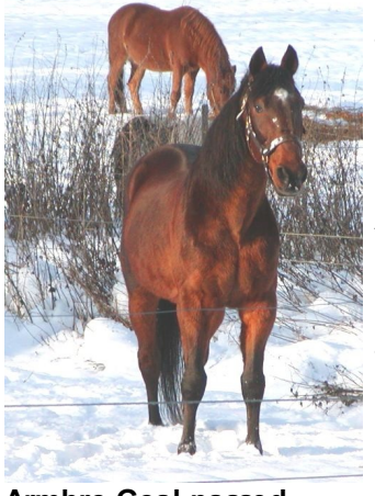
Armbro Goal passed 28

He roared back to the races as a sophomore and bowled over his New York-sired foes and won the Canadian Trotting Classic. But in the Yonkers Trot he jumped while leading in the stretch.