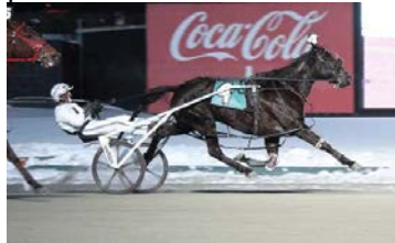
Golden Receiver is the 9-5 favorite in the Presidential Final

Through the first two legs of the Presidential Series at the Meadowlands Golden Receiver (Village Jove) has been outstanding, winning in successive weeks in fast times. But tonight’s $110,500 final could turn out to be a much stiffer task for the 7-year-old gelding, who will have to overcome some tough competitors and, perhaps, a pace scenario that won’t be to his liking.