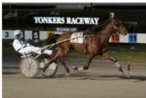
Son Of Nordic

8, YR, $33,000, Trot, OPEN, 28.0, 58.1, 1:26.2, 1:56.3, FT