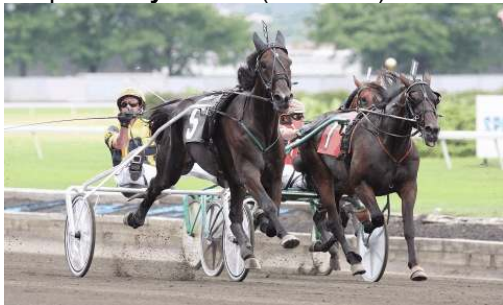
San Pail is a lock to be named Canada's Horse of the Year