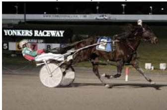
Oceans Motion

6, YR, $33,000, Pace, F&M OPEN HANDICAP POST POSITIONS 1-4 ASSIGNED POST POSITIONS 5-8 DRAWN, 27.1, 57.1, 1:25.0, 1:55.1, FT