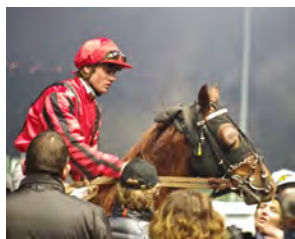
Barack, the horse that is

Going into the last race of the day, a mounted trot race, it