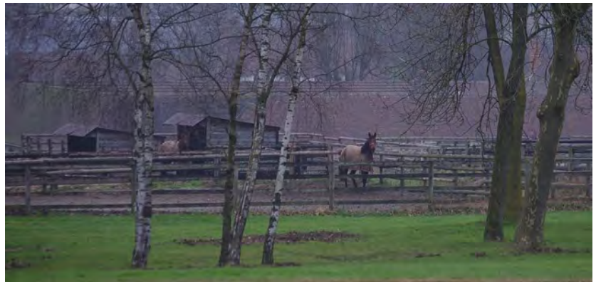
Turn-out paddocks at Grosbois