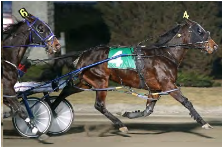
Kindofabigdeal takes the first of two Snowshoe Series

The Snowshoe Series final appeared to be wide-open on paper, as seven different horses won divisions during the first two legs.