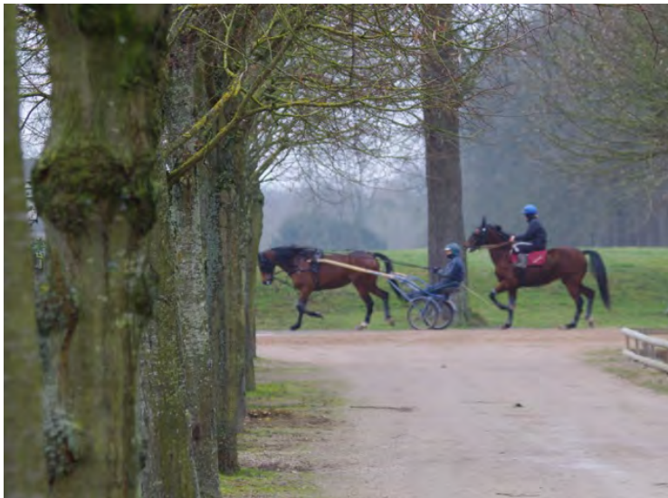
Two of the some 1,500 equine residents of Grosbois

BOISSY-SAINT LEGER, France --In the town of Boissy-Saint-Leger, about 11 miles southwest of Paris, there is a long, battered six-foot concrete wall running alongside a busy avenue. Scrawled with graffiti, the condition of the wall belies the two things it separates: a pleasant Paris suburb, and the Grosbois Trainer Centre, a huge, bucolic equine Shangri-la that is home to some 1,500 horses.