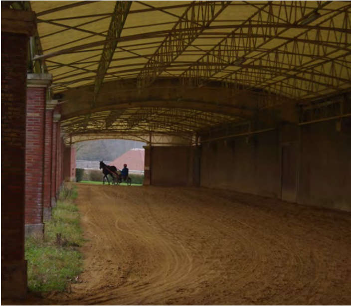
The covered track at Grosbois Trainer Centre