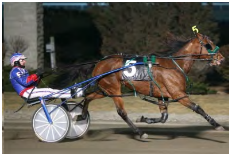
Artistic Fusion in 1:54.4

In the Blizzard Series final, heavy favourite Artistic Fusion completed the series sweep with a 1:54.4 victory.