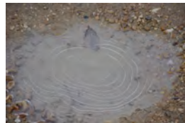
Even the ice is nice