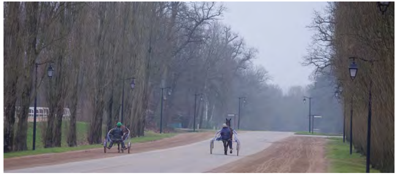
A nice way to go to and from the track