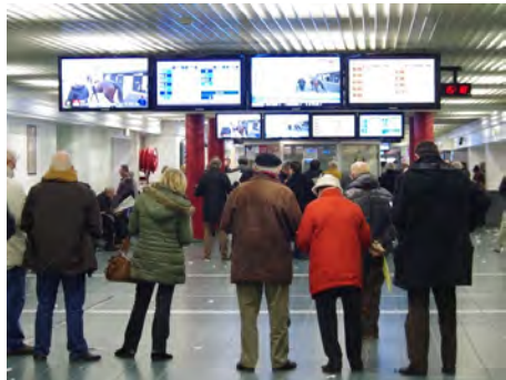
Horseplayers at Vincennes trying to dope out a winner

Leaning in, slightly disheveled and unshaved, he was showing me the horse had finished third in his last two races.