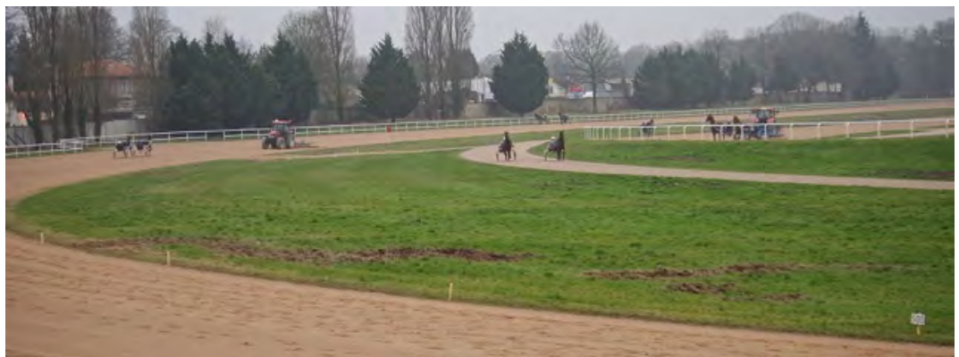
Horses exercising at Grosbois