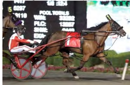
Big McDeal is among the horses scheduled to be sold Monday at the Meadowlands

The Supplement Catalog and updated racelines for the Meadowlands January Select Mixed Sale are now available on the Tattersalls website, www.tattersallsredmile.com , and on the Equineline sale catalog app for the iPad. The printed supplement catalog will be available