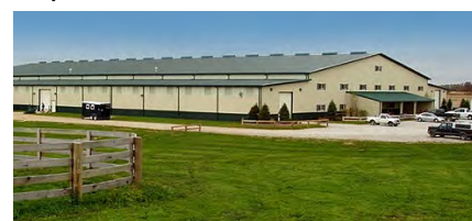
The Eden Park Equestrian Complex will host the return of the Ohio Selected Jug Yearling Sale

The Ohio Selected Jug Yearling Sale will be back in business this year, with the 2014 sale slated for September 15 at noon at the Eden Park Equestrian