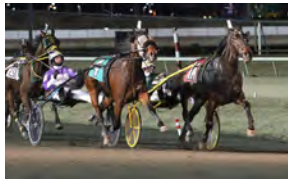
Time To Quit

2, M, $15,000, Pace. Super Bowl. 27.4 56.0 (28.1) 1:25.0 (29.0) 1:55.1 (30.1) FT