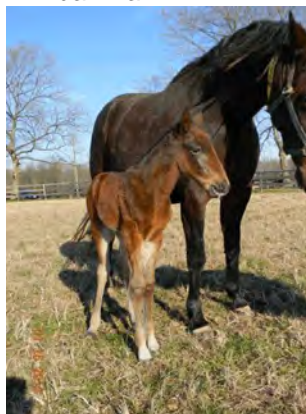
The newest addition to the Winbak family

As the new year begins, so does foaling season at Winbak Farm.