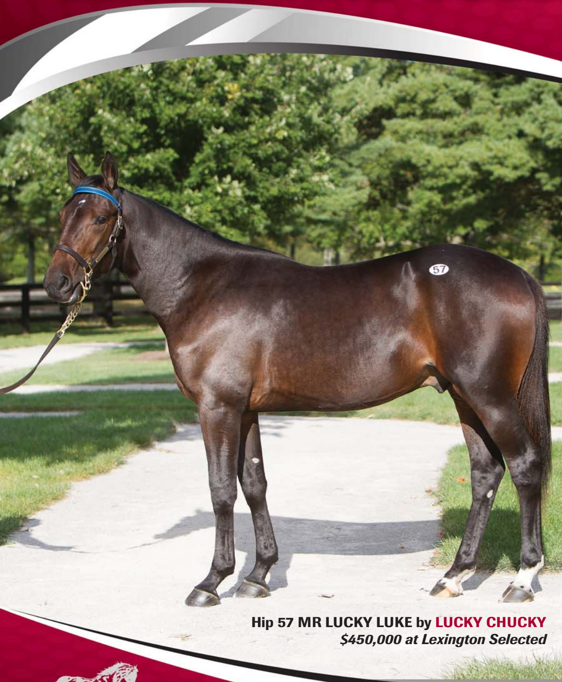
Hip 57 MR LUCKY LUKE by LUCKY CHUCKY $450,000 at Lexington Selected